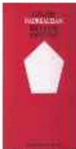
The Jewish Holocaust: A History by David Cesarani. The book is available in paperback and hardcover. The paperback is priced at £12.99 and the hardcover at £24.99.

the Holocaust. The book is a comprehensive history of the Holocaust, covering the period from the early 1930s to the end of the war. It is written in a clear and accessible style, and is suitable for both students and general readers. The book is available in paperback and hardcover. The paperback is priced at £12.99 and the hardcover at £24.99. The book is available in paperback and hardcover. The paperback is priced at £12.99 and the hardcover at £24.99.