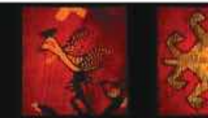
Fig. 1. Coat of arms of the Republic of Serbia (left) and the coat of arms of the Republic of Montenegro (right).

2016. In the following year, the number of requests for citizenship rose to 10,000, which was a record for the country. In 2017, the number of requests for citizenship rose to 15,000, which was a record for the country. In 2018, the number of requests for citizenship rose to 20,000, which was a record for the country. In 2019, the number of requests for citizenship rose to 25,000, which was a record for the country. In 2020, the number of requests for citizenship rose to 30,000, which was a record for the country. In 2021, the number of requests for citizenship rose to 35,000, which was a record for the country. In 2022, the number of requests for citizenship rose to 40,000, which was a record for the country.