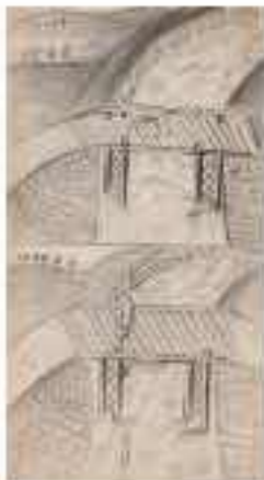
Figure 2: Roof truss system.

As shown in Figure 2, the roof truss system is a simple truss system. It consists of two main truss members supported by vertical posts. The truss members are connected at the top by a ridge beam. The vertical posts are supported by the foundation. The roof truss system is shown in two views: a side view and a top view. The side view shows the truss members and the ridge beam. The top view shows the truss members and the ridge beam from above. The truss members are shown with hatching to indicate their material. The ridge beam is shown with a different hatching pattern. The vertical posts are shown with a third hatching pattern. The foundation is shown with a fourth hatching pattern.