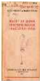
Document showing the early printout sequence for the first test run of the computer.

...the program was executed and it printed the first 100 characters of the output of the program. The output was printed on a line printer. The program was executed on a computer which had a memory of 1000 words. The program was executed on a computer which had a memory of 1000 words. The program was executed on a computer which had a memory of 1000 words. The program was executed on a computer which had a memory of 1000 words.