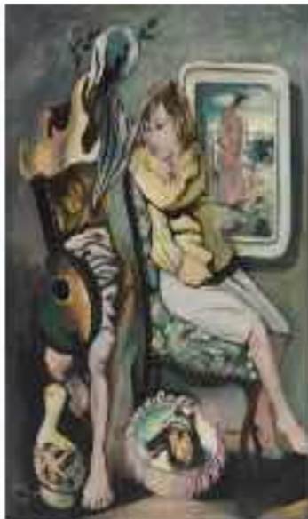
Salvador Dalí The Old Woman with Her Hair in the Air (1929)