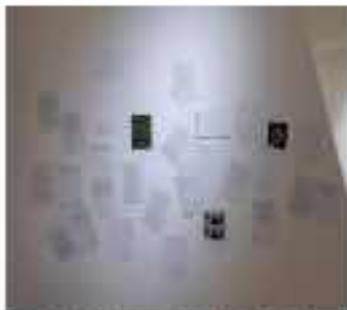
Figure 1. The wall-mounted display system. The display system is a wall-mounted display system (WMD) that is used for displaying information. The display system is a wall-mounted display system (WMD) that is used for displaying information.