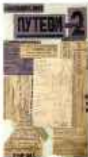
Παναγιώτης Παπαδόπουλος, Πυτέον 2 , 2008, 120 σελίδες, 15,00 €