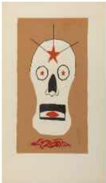
THE BOMBS (1952) (Museum of Modern Art, New York, NY)