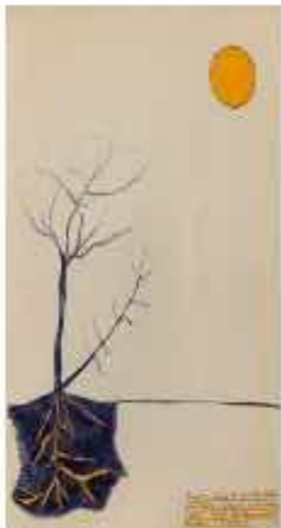
Walden Walden a part of the landscape of the artist's studio in the city of Walden, Vermont, 1910. Oil on paper.