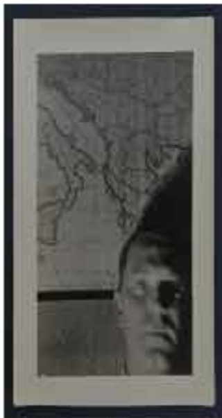
WOMAN'S FACE AND CAVE WALL, 1934-35.