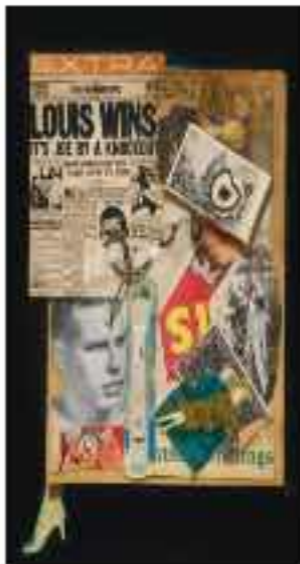
Robert Rauschenberg Louis Wins, 1985