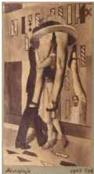
John Galsworthy, 1947 (Study for 'John Galsworthy, 1947')

Francis Bacon, 1947. Oil on canvas. 111.8 x 152.4 cm. The Art Institute of Chicago, Chicago, IL, USA.