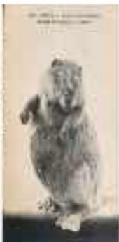
This is the first of...

The author of the book, which is published by the University of Chicago Press, is the author of the book, which is published by the University of Chicago Press. The author of the book, which is published by the University of Chicago Press, is the author of the book, which is published by the University of Chicago Press.