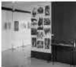
The author's previous work on the subject of the American landscape.