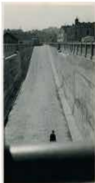
Wool Storage