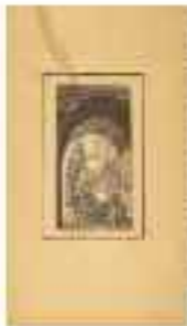
Portrait of a woman, likely a historical figure.