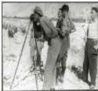
Figure 1. Aerial view of the study area, showing the location of the study site in the snow-covered field.