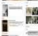
Exhibition 'The Book of David' at the National Portrait Gallery, London, 2015.

the exhibition was a surprising addition to my usual programming. It was a chance to see a collection of portraits that had been largely overlooked by the art world. The exhibition was a great success and I was very pleased to see it.