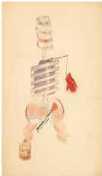
Fig. 10. A drawing of a stylized figure, possibly a character or object, with a red tassel and a brush-like object.