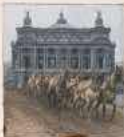
Будинг уряду ў краіні, дзе ўсталяваліся ўрады ў 1918 годзе.