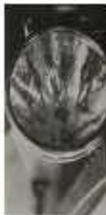
Photograph by David Laundy, 2011