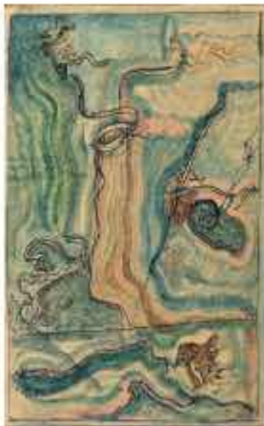
Wassily Kandinsky: Stimmung (Mood), 1911