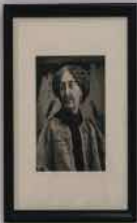
George Eastman, 1854-1904 Portrait by J. M. W. Turner, 1857 Gift of the Eastman Kodak Company, 1904