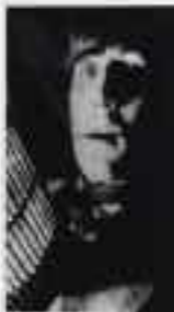
Black and white portrait of a man with a mustache, looking slightly to the right.