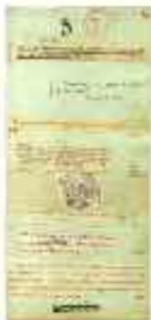
Two strips of aged paper, likely containing fragments of a document or manuscript. The strips are yellowed and show faint, illegible markings, possibly text or a drawing.