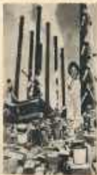
THE IRON WORKS