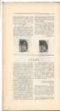
and to the child's face and to the mother's face to show why they are so.