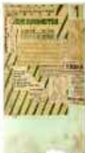
Νικόλαος Σακελλαρόπουλος, 100 Σύνθεσης Συντακτικής , 2008, 120 σελίδες, 15,00 €