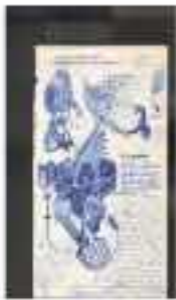
Handwritten Anatomical drawing of the eye, No. 12 (1788)