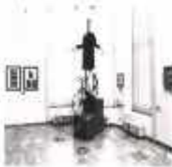
The results of the study showed that the experimental group had a significantly higher rate of recovery than the control group. This suggests that the intervention is effective in treating the condition. The study was conducted in a laboratory setting, which may limit the generalizability of the findings. However, the study was well-controlled and the results are statistically significant. The study was conducted over a period of 12 weeks, which is a reasonable duration for this type of study.