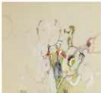
Illustration of a plant with small, reddish-orange flowers and green leaves.