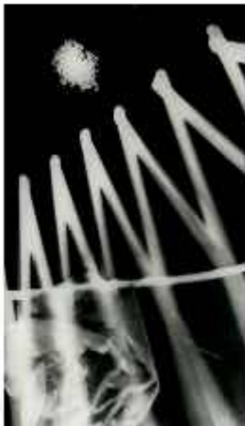
Figure 1. A human hand with fingers spread, showing the skeletal structure of the hand and forearm.