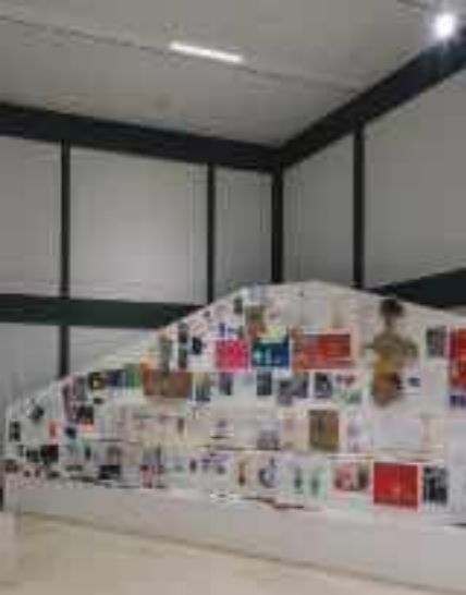
Felipe - A large-scale artwork by the artist Felipe, created in 2015. The piece is a large, multi-tiered structure covered in numerous small, colorful photographs and images. It is displayed in a gallery space with dark walls and a light floor. The artist, Felipe, is a Brazilian artist who works with various media, including photography, video, and installation. This piece is a reflection on the impact of social media and the way we consume information in the digital age. The structure is made of white foam and is covered in a dense layer of small, colorful photographs and images, creating a complex and multi-layered visual experience. The artist's intention is to explore the relationship between the individual and the collective, and the way we navigate the vast sea of information available to us in the digital age. The piece is a commentary on the way we consume information and the way we interact with each other in the digital age. The structure is a metaphor for the digital landscape, where information is constantly being shared and consumed. The artist's use of small, colorful photographs and images is a way to represent the vastness of the digital world and the way we interact with it. The piece is a reflection on the impact of social media and the way we consume information in the digital age. The structure is a commentary on the way we consume information and the way we interact with each other in the digital age. The piece is a reflection on the impact of social media and the way we consume information in the digital age. The structure is a commentary on the way we consume information and the way we interact with each other in the digital age. The piece is a reflection on the impact of social media and the way we consume information in the digital age. The structure is a commentary on the way we consume information and the way we interact with each other in the digital age.