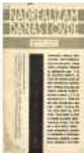
Decorative page layout from a book (Image 10)

where the eye is drawn and the text is read. The text is read in a certain order, and the eye is drawn to the text by the layout of the page. The text is read in a certain order, and the eye is drawn to the text by the layout of the page.