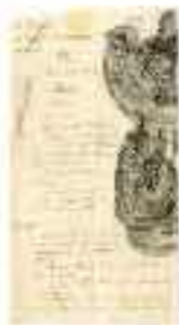
Handwritten Anatomical drawing of the eye, No. 11 (1788)