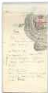
Manuscript British Library, London, MS. 1009, 10.