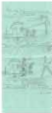
1914-15. The photograph is a reproduction of the original photograph.

The photograph is a reproduction of the original photograph. It shows a large, multi-story building with a prominent central tower or spire, possibly a church or institutional building, set against a light sky. The building has several windows and a complex roofline.