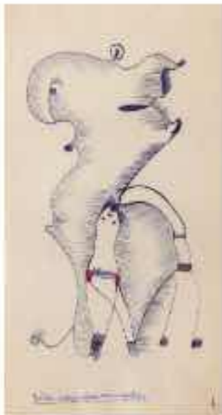
Figure 10.10: A watercolor illustration of two elephants, one large and one small, standing together.