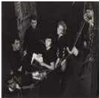
From left to right: Laurence Fishburne, Morris Chestnut, Cuba Gooding Jr., Ice Cube, Morris Chestnut, Cuba Gooding Jr., Laurence Fishburne, Ice Cube, Morris Chestnut, Cuba Gooding Jr.

the film's cast and crew. The film's success was a testament to the power of community and the importance of representation in Hollywood. The film's success was a testament to the power of community and the importance of representation in Hollywood.