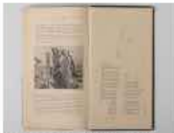
George Eastman's North American Indians, 1875.

the image of a group of people, possibly a family or a community, gathered together. The right page contains text, likely a list or index, organized in columns.