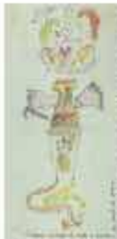
Abstract work by artist [name] showing a central figure with various colors and textures.

The artist's work is characterized by a central, elongated, yellowish-green form with various colors and textures. This form is set against a light background and appears to be a drawing or painting on a textured surface. The colors used include shades of red, purple, blue, and green, creating a vibrant and dynamic composition. The overall effect is one of a complex, multi-layered image that invites the viewer to explore its details and interpret its meaning.