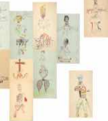
These cards, used in the first part of the study, were designed to be used in the first part of the study. (Kleinman, 1981)