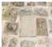
Handwritten notes and diagrams on a wall, possibly related to the text on the right.