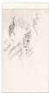
Manuscript British Library, London, MS. 1009, 11.