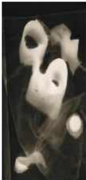
Black Jacket (See Documentation 18)