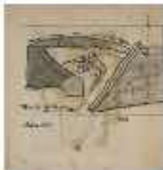
Hand and forearm