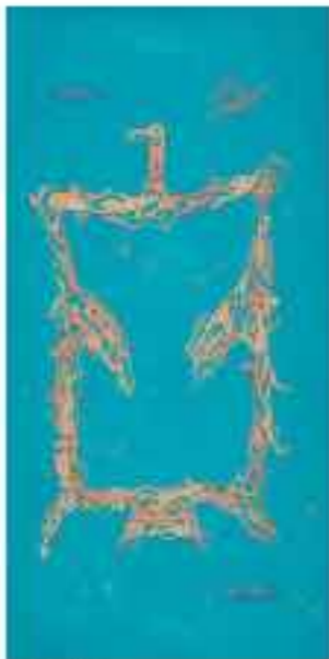
Irma Obata, Untitled , 1950. Oil on canvas, 100 x 100 cm.