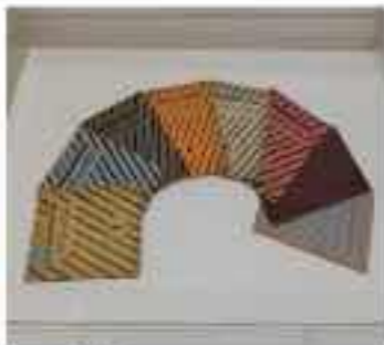
Intensity of Blue (R10)