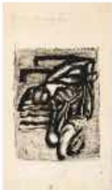
Hand and forearm