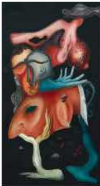
Mark Rothko, Untitled (Red and Blue) , 1951.