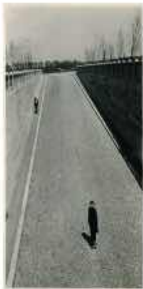
Photograph by the author, 2010.